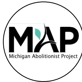
MICHIGAN ABOLITIONIST PROJECT