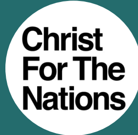
CHRIST FOR THE NATIONS