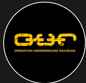
OPERATION UNDERGROUND RAILROAD