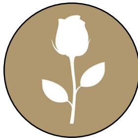
BARRY COUNTY RIGHT TO LIFE